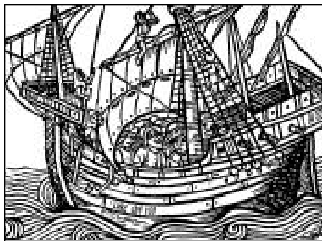
Design courtesy of © Newport Mary Rose Photography © Ron McCormick Printing by A Print, Newport

Two public viewings of the archaeological site have already attracted around 10,000 visitors.